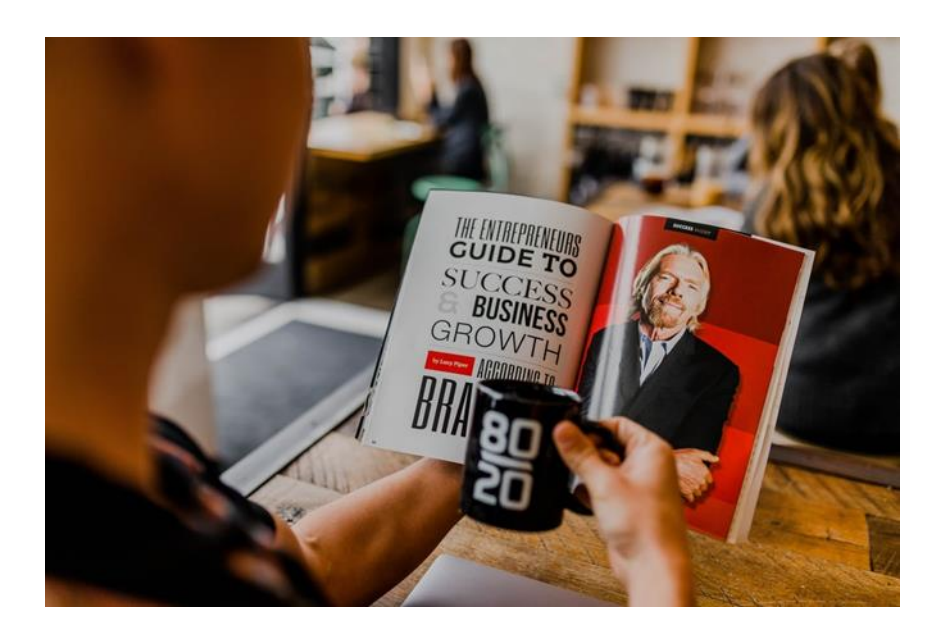
VOLANO 4 – Entrepreneurial Spirit – Challenge 3