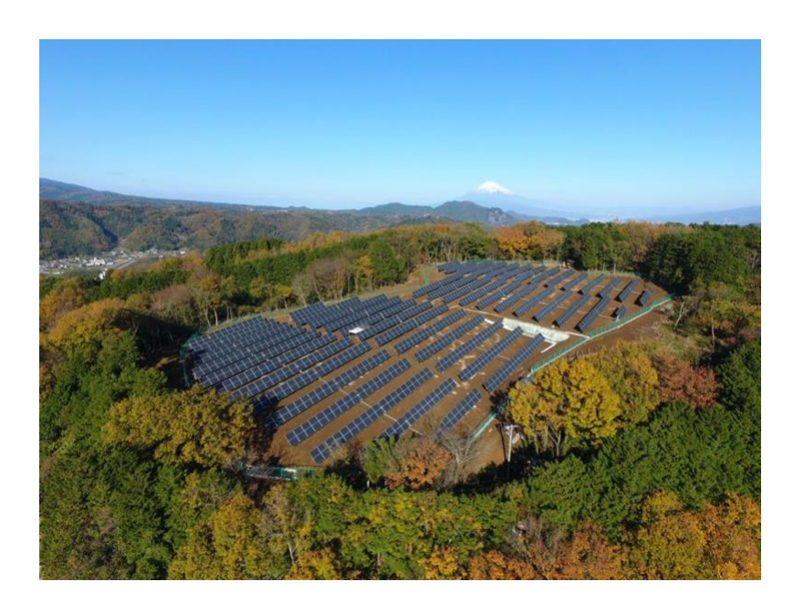
Travel 4 – Entrepreneurial Spirit – Challenge 5