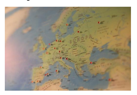
Travel 4 – Entrepreneurial Spirit – Challenge 3